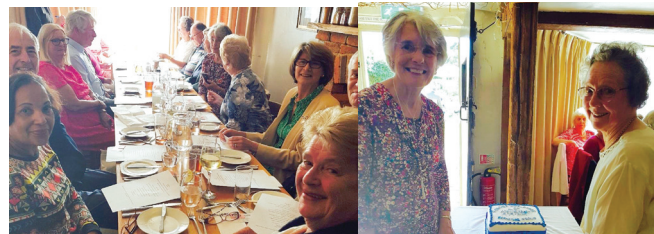
Berkshire Branch Celebrated their 40th Anniversary

As always some of the members play Mah Jong regularly. As a Branch we do contribute to the 100