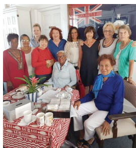
Bahamas 2019 Committee Members