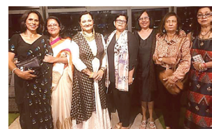
Mauritius Plateau Gala Dinner

Mauritius Plateau – This year Plateau dedicated the month of September to giving back to those less fortunate. The committee has focused on supporting women and children in need. A Gala dinner was held on the rooftop of the Palm Hotel in Quatre Bornes and raised a total of Rs 26000 (£286 sterling).