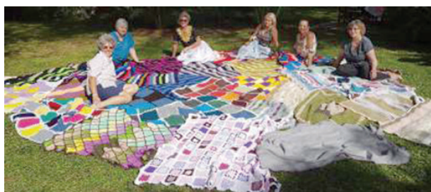
Tanzania's Crochet Without Boarders Group

Tanzania, Dar es Salaam – In September the branch welcomed six new members at the large room on the top floor of the Double Tree by Hilton with panoramic views of the Indian Ocean and bay.