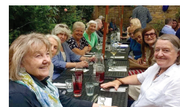
London Events Summer Lunch in Richmond Upon Thames