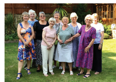
Northwest Branch Summer Lunch

Northwest – We had a lunch on 14th March at a very nice restaurant, "The Architect", in Chester, which overlooks Chester racecourse. It was a very nice spring day.