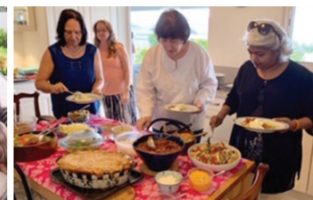
North Mauritius members at the Pot Luck Lunch