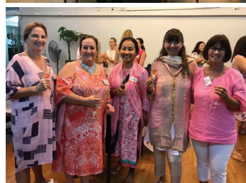
Pinktober Fundraising in Fiji

On Friday 25 October the Corona Society Fiji held a Pinktober High Tea at Pacific Fusion USP Campus in order to raise money for the Fiji Cancer Society. They also donated bras for Breast Cancer survivors.