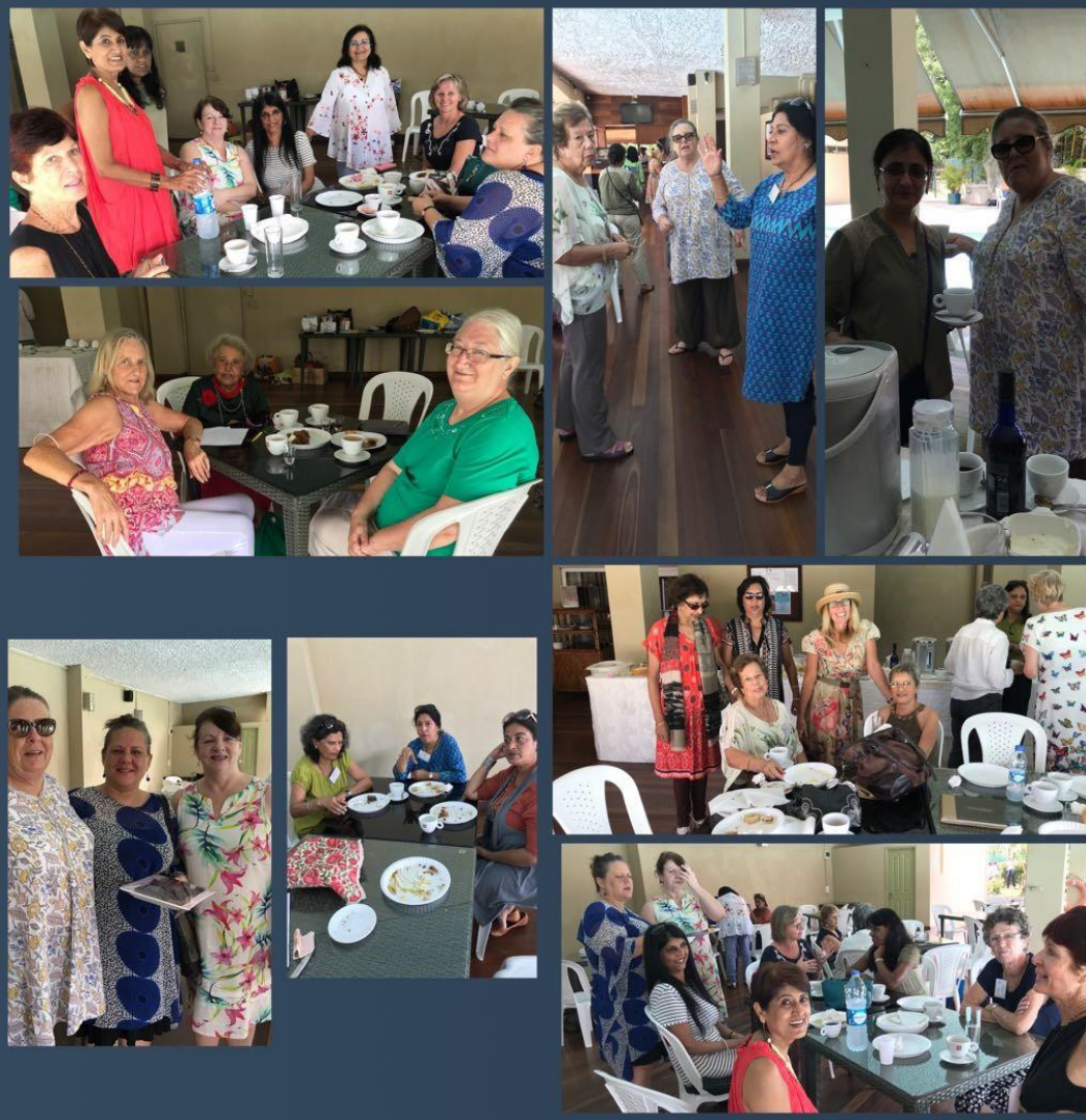
A morning spent with friends to catch up on girls' talks. A pre-Christmas celebration to bring in the festive air with tasty nibbles and great company.