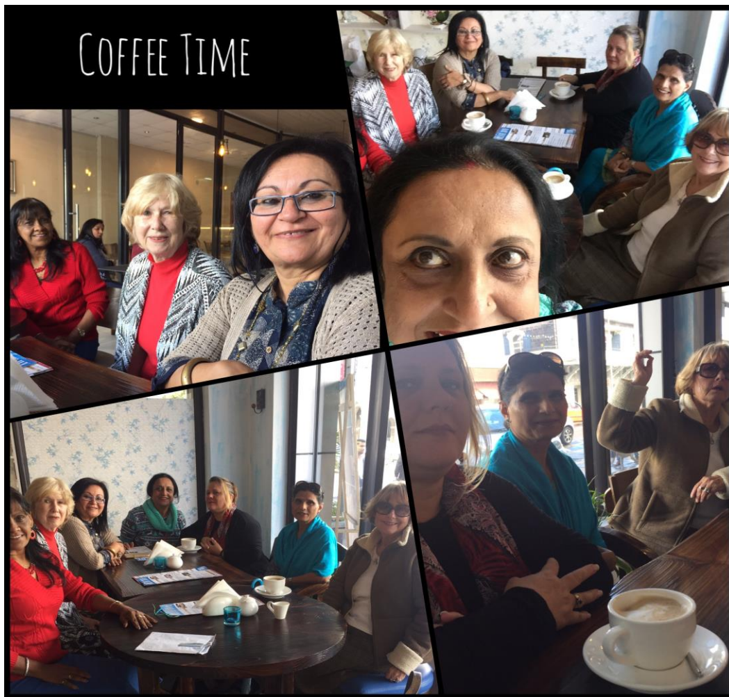
Smiling faces, jokes and lively banter to bond friendships at the coffee table.